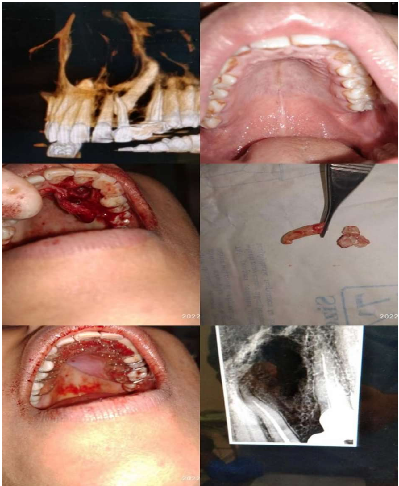
Fig 3: CBCT showing position of palatally impacted canine, clinical picture of surgical site, surgical extraction and tooth sectioning, placement of splint and post-operative radiograph.

computed tomography or conventional radiographs are the most commonly used diagnostic tools to determine the location of the impaction.