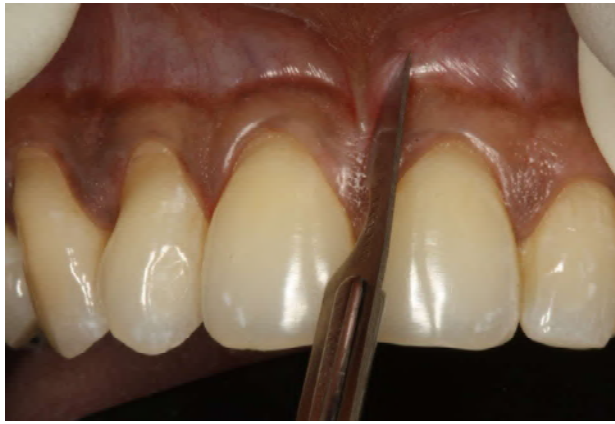
Fig. 2: Vestibular Incision