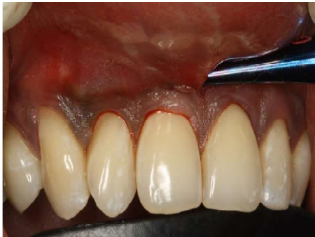
Fig. 3: Subperiosteal tunnel created

Having prepared the recipient site, connective tissue graft of appropriate size was harvested from the palate distal to the premolar region (Fig. 4). Glandular tissue remnants were removed from the graft. The graft was then tucked into the prepared tunnel. Care was taken to ensure it extended well beyond the site of recession. Along with the gingival complex, it was advanced coronally and held in position with a composite button on labial aspect of tooth. Coronally anchored sutures (expanded PolyTetraFluoroEthylene sutures; 5-0) were attached to these buttons and cured. (Fig. 5) Periodontal dressing was placed over the site.