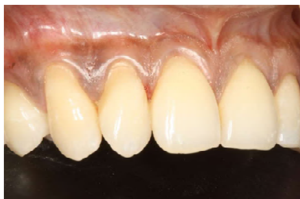
Fig. 1: Preoperative view

A 39-year-old male came to the Department of Periodontics with a chief complaint of tooth sensitivity in the upper anteriors (Fig. 1). There was no significant medical or family history and patient had no habits. Clinical examination revealed Millers class 1 gingival recession in multiple contiguous teeth from 13 to 21. There was presence of adequate keratinized gingiva and good vestibular depth. The initial visit of the patient involved scaling and root planing. Multiple oral hygiene instructions were given post procedure, and then she was recalled after a week for the recession coverage technique.