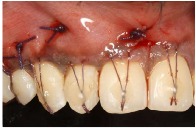
Fig. 5: Suturing done