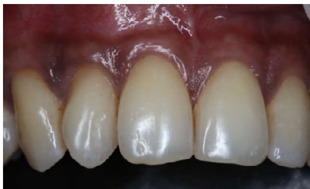
Fig. 6: Post operative 6 month

Follow-up done after 6 months (Fig. 6) reveals recession coverage and an overall decrease in teeth sensitivity. Thus, the treatment outcome is said to be favorable with minimum discomfort to patient.