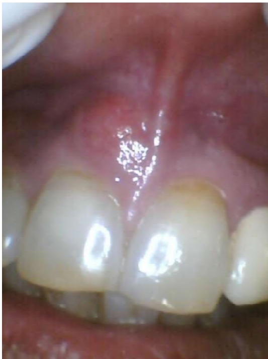
Fig. 2: Gingival abscess with 11 and 21

an endo-perio lesion was suspected. Access opening of 11 did not show pus discharge from root canal, hence deep scaling was planned for periodontal infection. However, scaling was accompanied with severe pain and there was no bone resistance felt on scaler tip. Palatal swelling was further enlarged in comparison; hence, CBCT of maxillary arch was advised (Fig 3). CBCT report showed congestion of maxillary sinus (Fig 4). Clinical and radiological presentation were suggestive for Mucormycosis. Further consultation with the otolaryngologist confirmed the diagnosis of Mucormycosis infection. Antifungal drugs were commenced immediately. However, CBCT report on