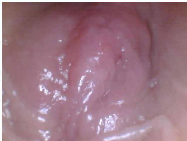
Fig. 3: Increased palatal swelling on recent appointment

an endo-perio lesion was suspected. Access opening of 11 did not show pus discharge from root canal, hence deep scaling was planned for periodontal infection. However, scaling was accompanied with severe pain and there was no bone resistance felt on scaler tip. Palatal swelling was further enlarged in comparison; hence, CBCT of maxillary arch was advised (Fig 3). CBCT report showed congestion of maxillary sinus (Fig 4). Clinical and radiological presentation were suggestive for Mucormycosis. Further consultation with the otolaryngologist confirmed the diagnosis of Mucormycosis infection. Antifungal drugs were commenced immediately. However, CBCT report on