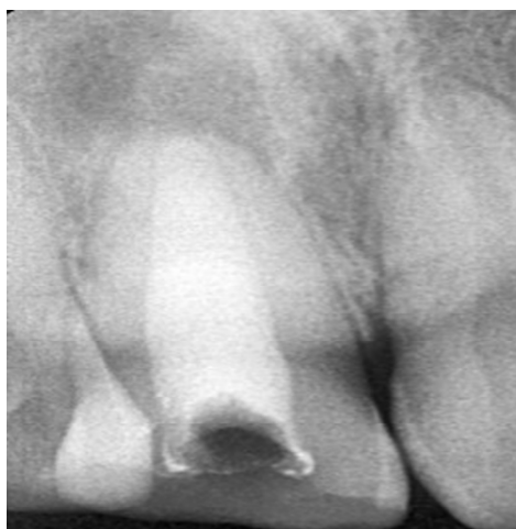
Fig. 9: Post operative radiograph