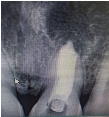
Fig. 5: Post Operative Radiograph

After 72 hours, the hard set of MTA was confirmed and the remainder of the root canal was obturated with cold lateral compaction and zinc oxide eugenol sealer (Fig 4). followed with post endo restoration with composite.