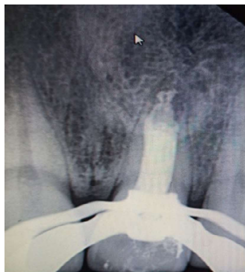
Fig. 3: Calcium Hydroxide Placed