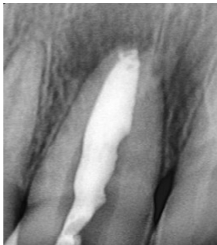
Fig. 8: Calcium hydroxide placed