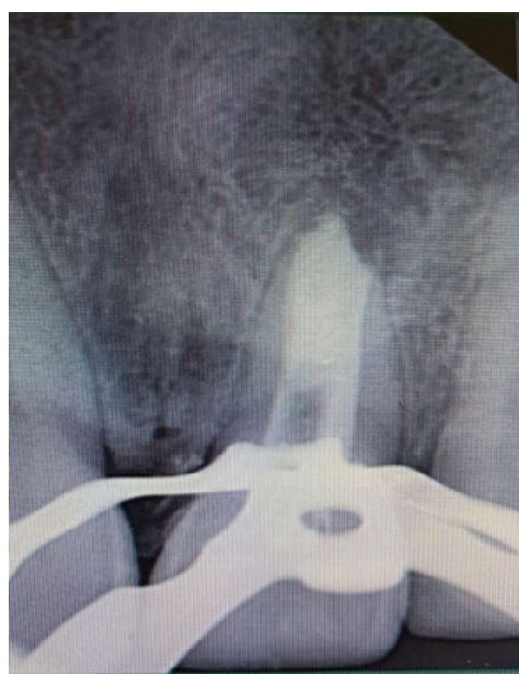
Fig. 4: MTA Apical Plug

At the second appointment, calcium hydroxide was flushed with 5% sodium hypochlorite and rinsed with saline. Final irrigation was done with 2% chlorhexidine