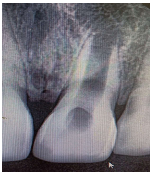
Fig. 2: Preoperative Radiograph

and the canal was dried with paper points. MTA (Dentsply, Tulsa Dental, and Johnson City, USA) was mixed according to the manufacturer's instructions and carried to the canal with an amalgam carrier. Apical plug of 6 mm of thick paste of MTA was placed and confirmed radiographically (Fig 3). A sterile cotton pellet moistened with sterile water was placed over the canal orifice and the access cavity was sealed with Cavit (3M ESPE, Seefeld, Germany).